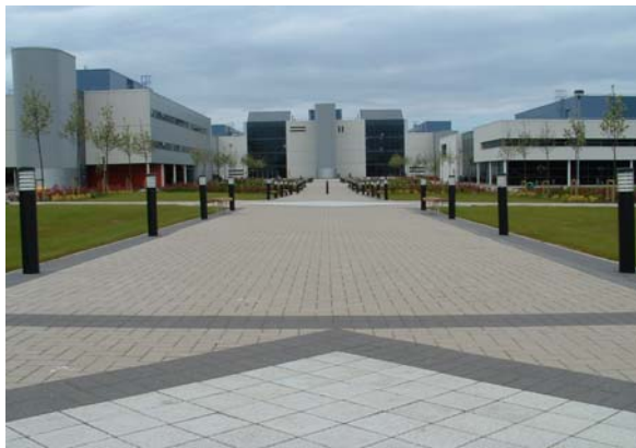
New College Durham campus.