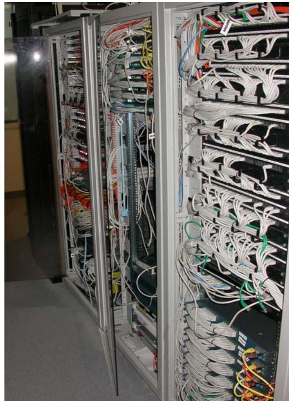
Networking cabinets at the core of the infrastructure.

In 2002, the college was given planning permission to build a new £35 million campus at Framwellgate Moor. The HE campus at Neville's Cross closed and moved to Framwellgate Moor. Construction work began in 2003 with the new buildings being